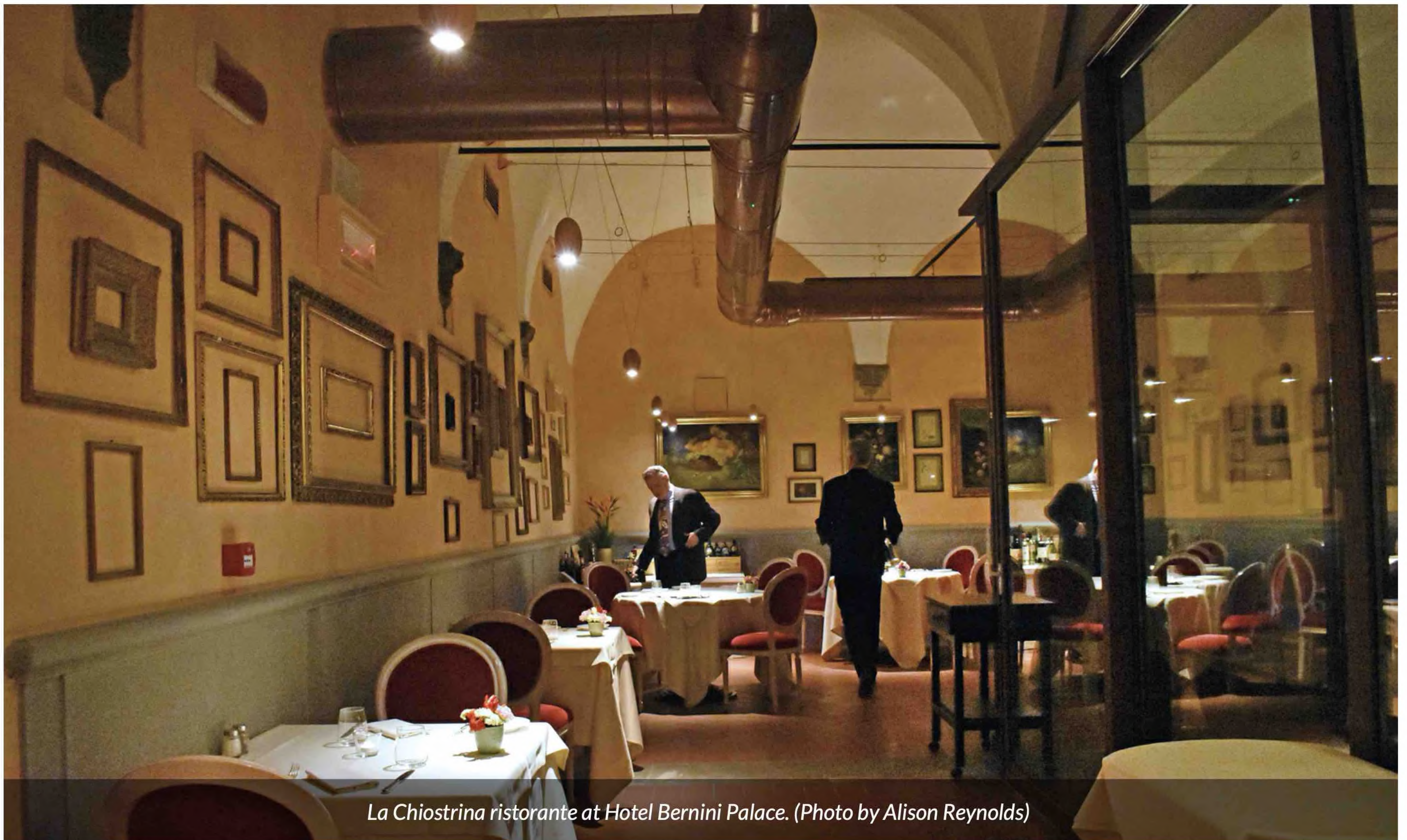
La Chiostrina ristorante at Hotel Bernini Palace.

Exposed crimson industrial piping adds a modernist element to the room. In the elbow of the L, a floor to ceiling glass wall with a sliding door leads to a casual garden filled area with wicker chairs for before dinner drinks.