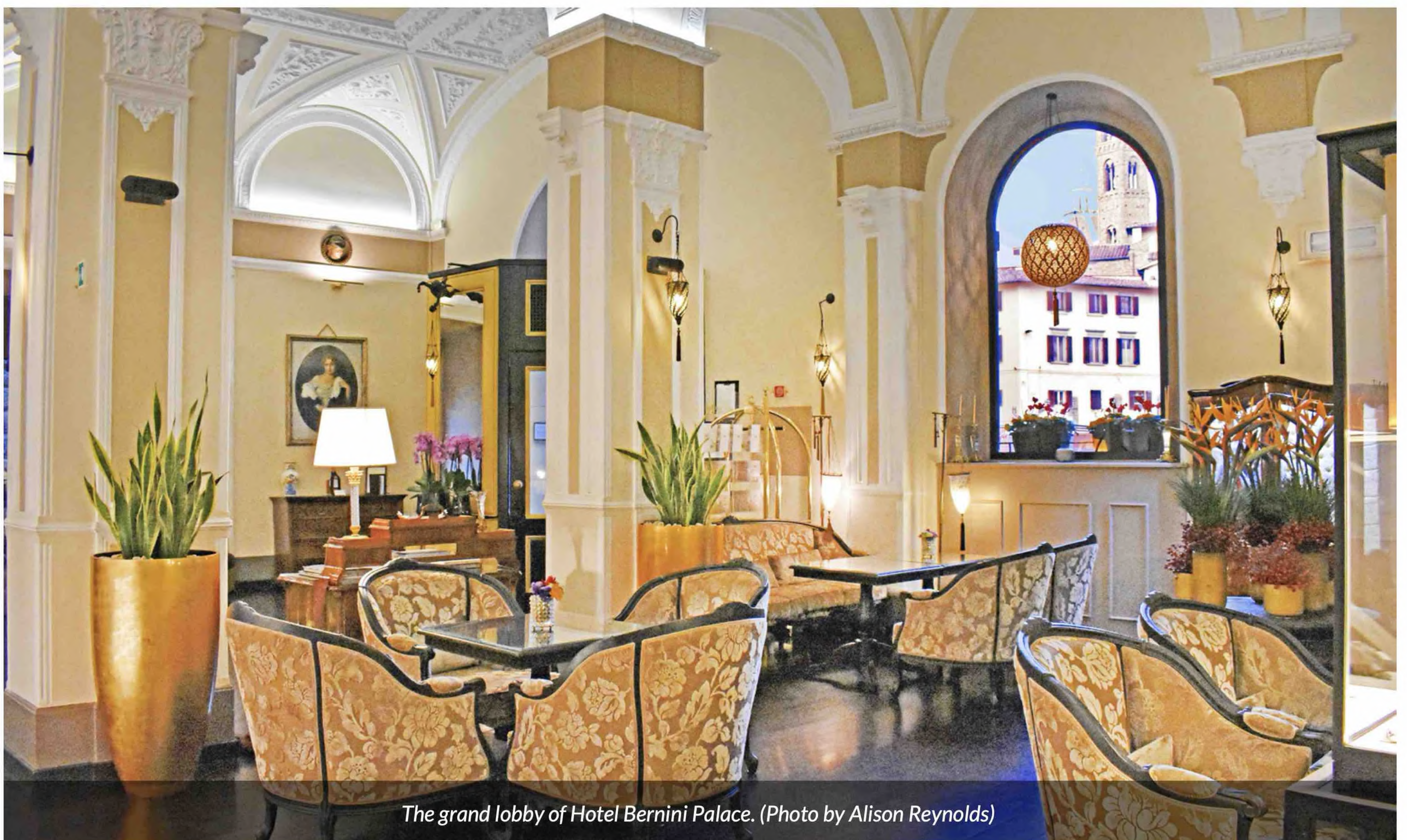
The grand lobby of Hotel Bernini Palace.

The lobby is a gorgeous antechamber of stunning design. Vaulted ceilings set on a series of pillars arch their way across a beautifully appointed sitting area filled with settees and couches. An art deco bar area glimmers in one corner. The ceilings are covered with ornate plaster designs