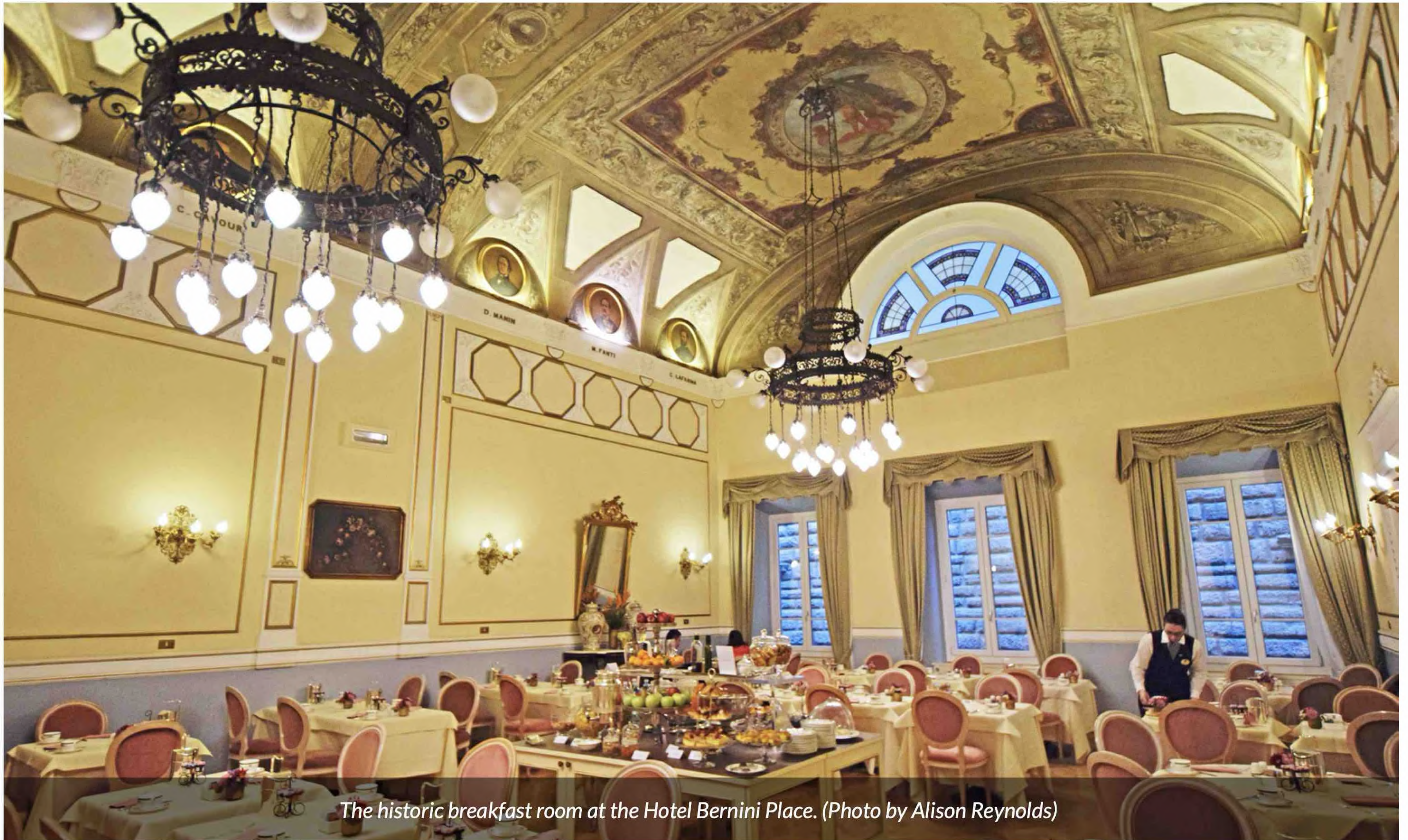
The historic breakfast room at the Hotel Bernini Place.